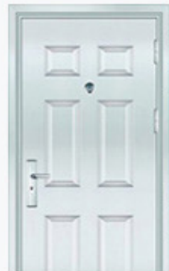
Stainless steel door